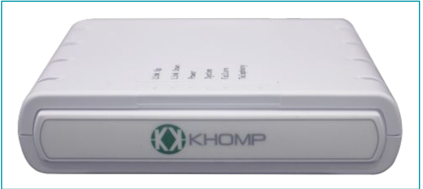
Subtitle: Front view.