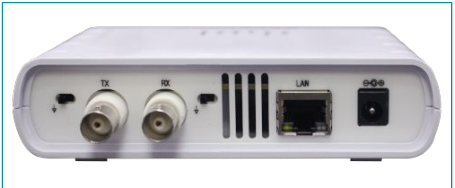
Subtitle: Rear view, E1 link with BNC coaxial connector